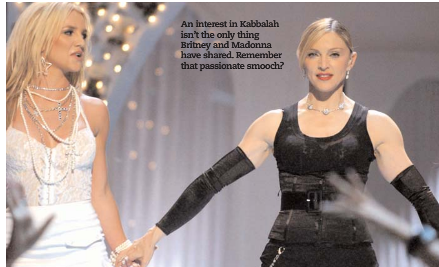
An interest in Kabbalah isn't the only thing Britney and Madonna have shared. Remember that passionate smooch?

Even though Britney and Kevin were married in a nondenominational Christian ceremony, she has been vocal about her interest in different world religions, including the Jewish mystical study of Kabbalah, which she was introduced to by her friend and mentor, Madonna. A source says Britney is very serious about her spirituality, and has even worn a red string on her wrist (it's said to deflect envious stares and evil intent) and donated $32,000 to the Kabbalah Centre. After her wedding ceremony, Britney gave her bridesmaids custom-made Bolsa bags bearing the Kabbalah word in Hebrew that means "the power to heal." "Britney is searching for a way to cope with all the pressures of her life," says the insider. "Having spiritual guidance helps her to see the big picture and count all her blessings, which, of course, she does."