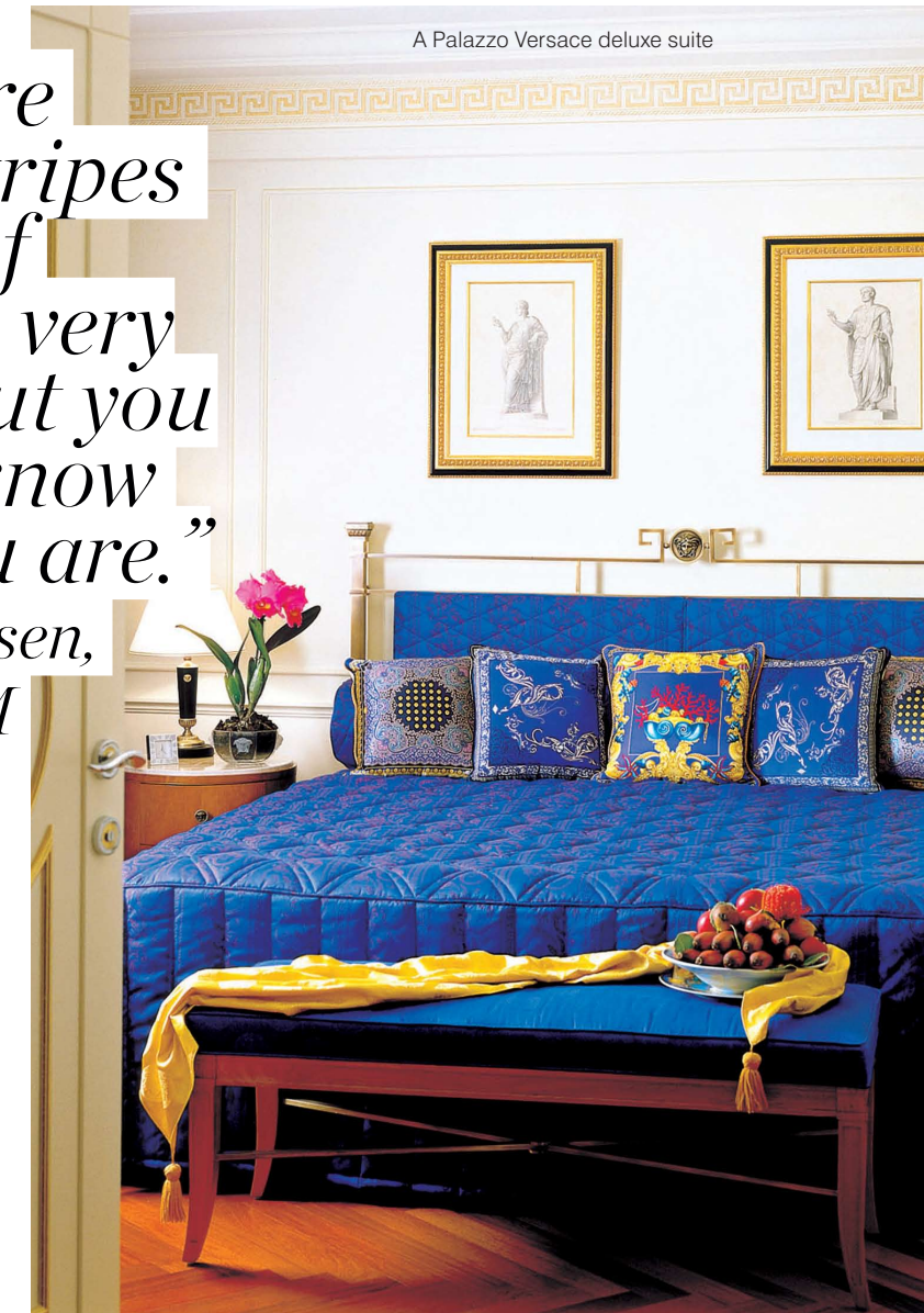
A Palazzo Versace deluxe suite

American designers have been late to the trend, but Ralph Lauren added his aesthetic to the remodel of Round Hill Hotel and Villa's Pineapple House for a look that's decidedly British Colonial: White walls and tile floors contrast with mahogany furnishings, such as canopy beds, and accent pillows in turquoise, yellow and pink.