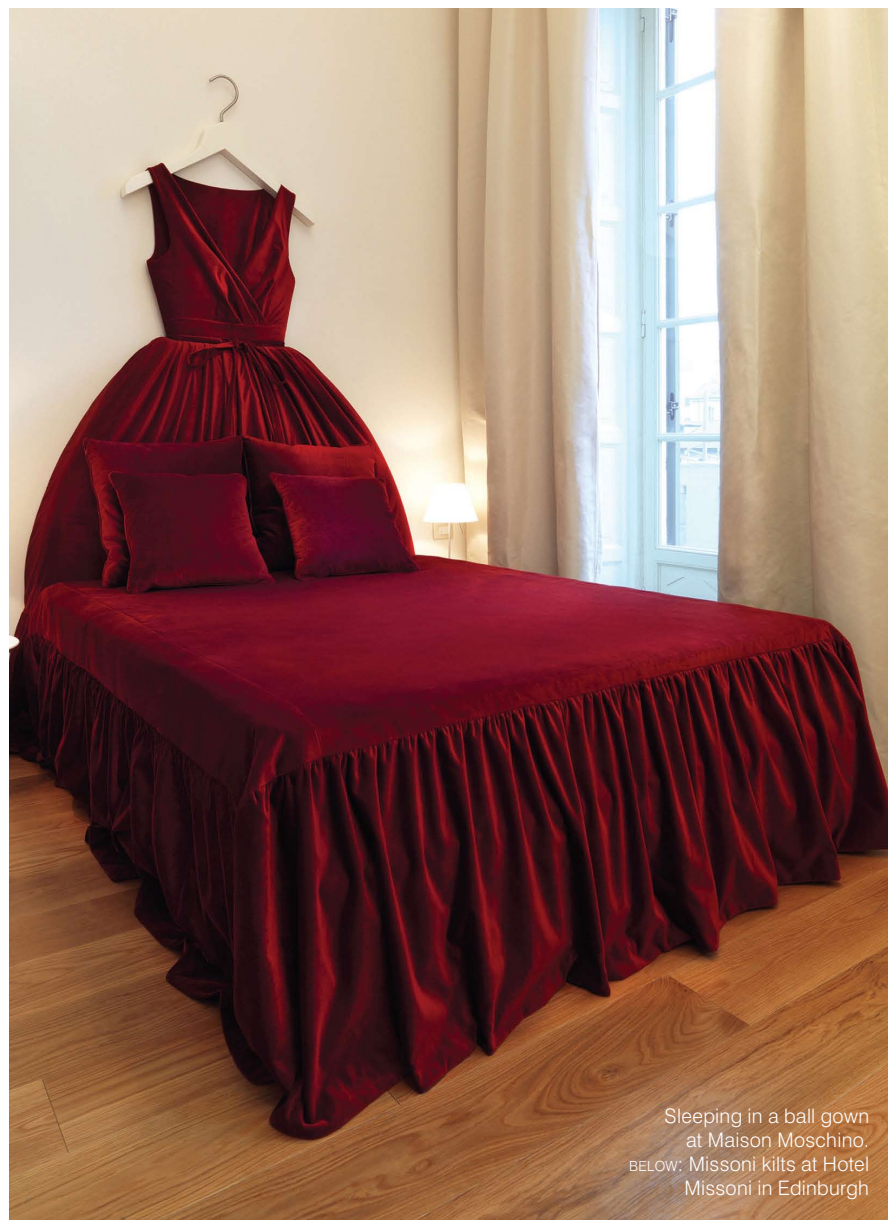
Sleeping in a ball gown at Maison Moschino. BELOW: Missoni kilts at Hotel Missoni in Edinburgh