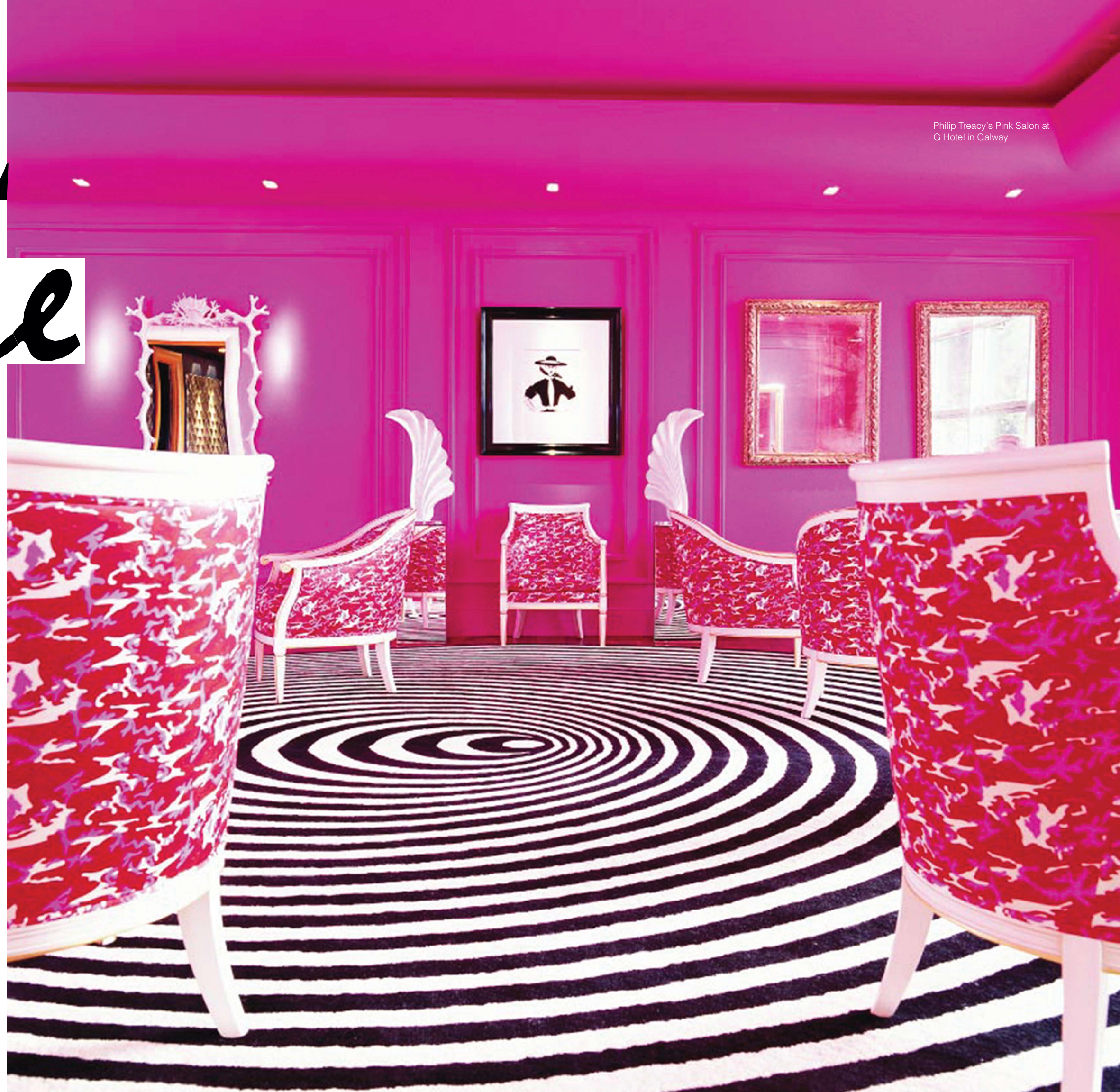
Philip Treacy's Pink Salon at G Hotel in Galway

DESIGNERS HAVE PUT THEIR stamp on just about everything, from statement bags and logo'd luggage to blingy sunglasses and key fobs. It's no surprise, then, that the world of fashion eventually set its sights on interior design. The recent influx of collaborations between high-end designers and hoteliers is a match made in the pages of Vogue : Like Parisians and scarves or private jets and resort collections, fashion and travel just go together.