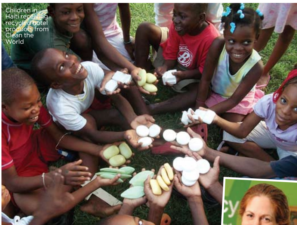
Children in Haiti receiving recycled hotel products from Clean the World